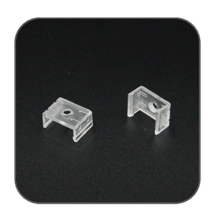
Mounting Clip (PC)